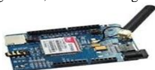
Figure.2. GSM Module

GSM Modem: This GSM Modem can track the SIM card and operates similar to a cellular telephone using its particular mobile number. Favorable position by applying this GSM modem can be monitored by connecting an RS232 cable to transfer information to the system (Vijayaragavan, 2014, Karthik, 2013; Kanniga, 2011, 2014). Functions like information exchange through SMS, vehicle locking is performed using this system.