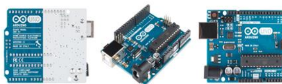
Figure.4. ARDUINO UNO

analog and discrete Input and output pins and also has provision for connecting to different peripherals. The board has USB for loading programs from personal computers. The microcontrollers in the Arduino board can be programmed using C and C++ languages by creating an integrated development environment (IDE).