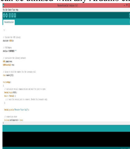
Figure.5. Arduino Software

The open source software used by Arduino makes it simple to compose the coding and transfer it to the kit. It keeps running on all operating systems like Windows, Linux and Mac OS X. The platform is composed in Java and other platform. This programming can be utilized with any Arduino embedded board.